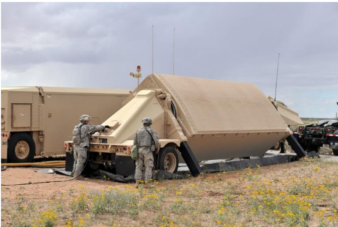
THAAD's AN/TPY-2 Radar