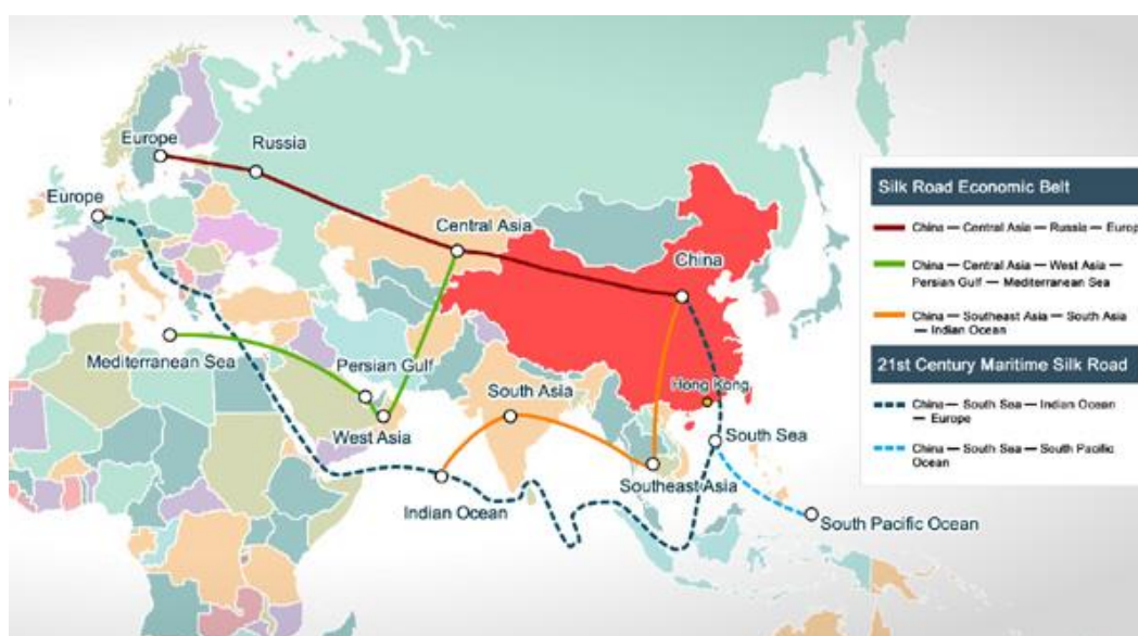
Figure 1. Main Routes of the Belt and Road Initiative

The reasons American ambivalence are easy to grasp as significant questions remain unanswered: What are China's real motives? Will it uphold the values that it professes in the face of intense global economic competition and ongoing geopolitical rivalries? As China gets stronger economically and militarily, will it see itself as an exceptional nation that is above the rules that apply to smaller countries? During bidding for projects across the vast expanse of BRI, will China bring its huge state apparatus to exert undue pressure on potential partners, placing its quasi-private companies at an unfair advantage over competitors? Will China act transparently when bidding for infrastructure projects that have long-term strategic significance?