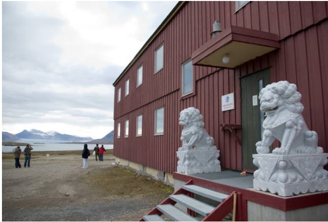
China’s Yellow River research station on Svalbard, Norway.

“ Understand ” and “ protect ” are the other two principles highlighted in China’s white paper. China’s Arctic policy uses these two words to underscore the importance of improving the capacity and capability of scientific research in the region, so as to create favorable conditions for mankind to better protect, develop and govern it.