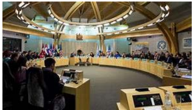
The Arctic Council in session.

Observer status in the Arctic Council is open to non-Arctic states, inter-governmental and inter-parliamentary organizations and NGOs. States that enjoy observer status receive automatic invitations to attend Arctic Council meetings. Before 2013, the composition of the observer states was predominantly European; it included France, Germany, the Netherlands, Poland, Spain and the United Kingdom. Participation of the observer states is seen by the Council as “a valuable feature through their provision of scientific and other expertise, information and financial resources” (Arctic Council).