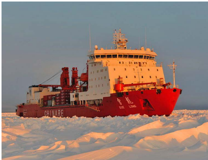
The Xue Long ( Snow Dragon) is the first Chinese vessel to cross the Arctic Ocean.

China, Japan and South Korea in particular see the melting Arctic Ocean as a unique opportunity for international trade and access to resources. In September 2012, China's icebreaker Xue Long ( Snow Dragon ) made history by becoming the first Chinese vessel to cross the Arctic Ocean. The vessel crossed the Pacific to the Atlantic and carried out oceanographic research; this 85-day voyage was a clear statement of Beijing's interest in increasing its presence in the Arctic. The Shanghai-based Polar Research Institute of China said in a statement that the Snow Dragon gained "first-hand information about navigation in Arctic sea lanes, the oceanic environment and carried out useful exploration and practice for our nation's ships that use Arctic passages in the future" (National Post, 2012).