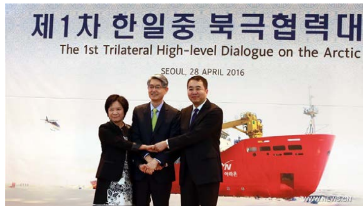
Delegates from South Korea, Japan and China at the 1st Trilateral High-level Dialogue on the Arctic.

The white paper also highlights China's will to cooperate with other non-Arctic states. In 2016, China, Japan and South Korea launched high-level trilateral dialogues on Arctic issues to promote exchanges on policies, practices, and experience regarding Arctic international cooperation, scientific research, and commercial cooperation.