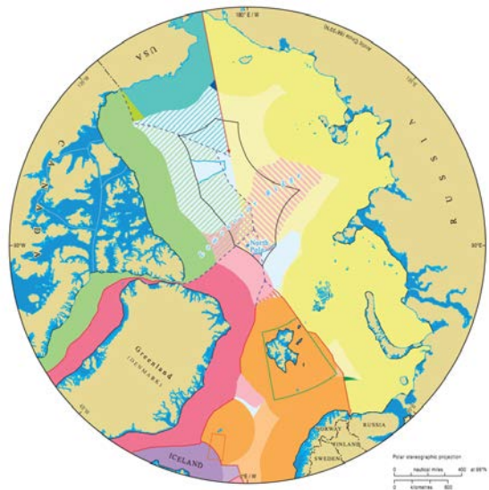
Commission on the Limits of the Continental Shelf (CLCS) Map.

Article 136 of UNCLOS provides that the “Area” beyond national jurisdiction and its resources are the common heritage of mankind, and Article 137 declares that “no State shall claim or exercise sovereignty or sovereign rights over any part of the Area or its resources. All rights in the resources of the Area are vested in mankind as a whole, on whose behalf the International Seabed Authority shall act” (UNCLOS). The non-Arctic states have interests in the exploration and exploitation of the natural resources in the seabed beyond the jurisdiction of any Arctic states in this region. However, the general conduct of states in relation