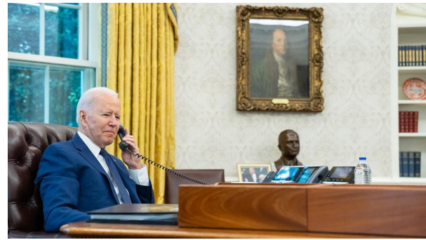
President Biden speaks on the phone in the Oval Office in July, 2021