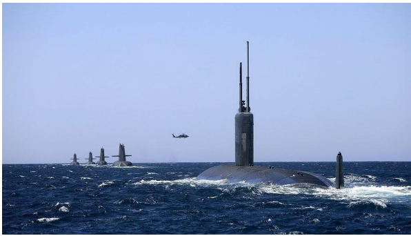
U.S. and Australian Submarines train together in February, 2019