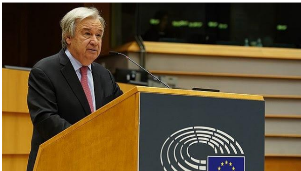
UN Secretary-General António Guterres speaking at the European Parliament in June, 2021