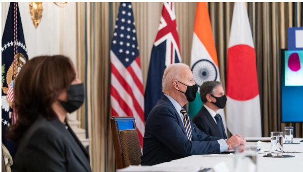
Biden Administration officials at the Virtual Quad Summit in March, 2021

- On September 18, it was reported that the upcoming September 24 meeting of the Quad will likely focus on furthering joint infrastructure initiatives to counter China's Belt and Road Initiative in the Indo-Pacific. - On September 16, Secretaries Blinken and Austin hosted their Australian ministerial counterparts in Washington. The consultations led to a joint statement reaffirming both states' commitment to a "rules-based international order" in the Indo-Pacific, particularly in the South China Sea. - On September 14, President Biden announced that the U.S. would host a summit of the Quad security pact in Washington.