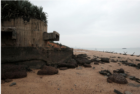
An abandoned bunker on Kinmen island