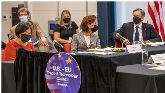
Tai, Raimondo, and Blinken at the U.S.-EU TTC