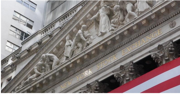
The New York Stock Exchange