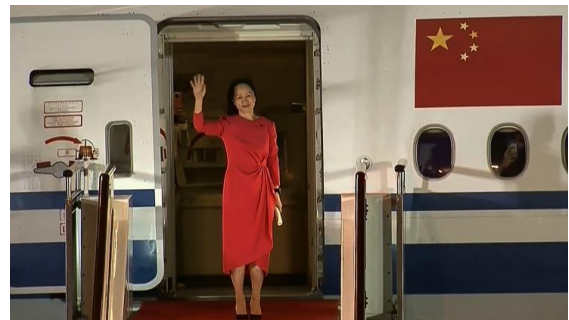
Meng Wanzhou waves at onlookers after landing in Shenzhen