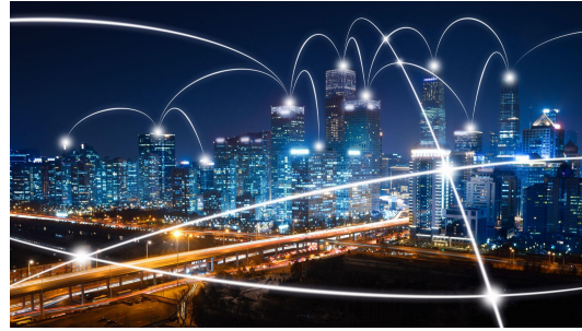
A skyline of Beijing at night