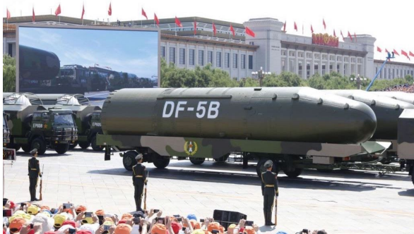
Chinese intercontinental ballistic missiles on display during a parade in Beijing on September 3, 2015