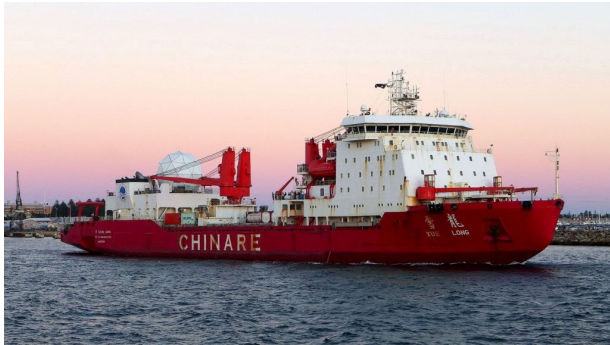
Xue Long, a Chinese icebreaker ship, departs from Western Australia in 2016