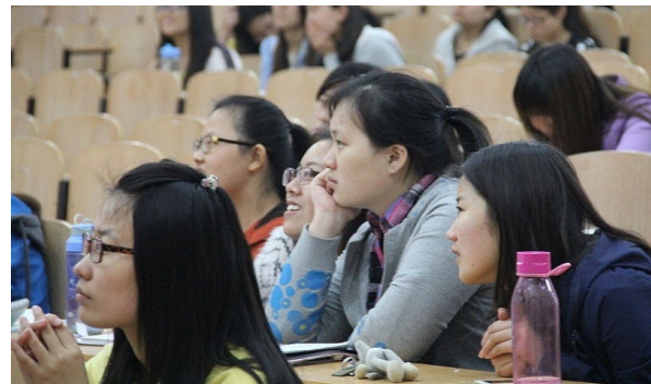
Chinese university students attend a lecture