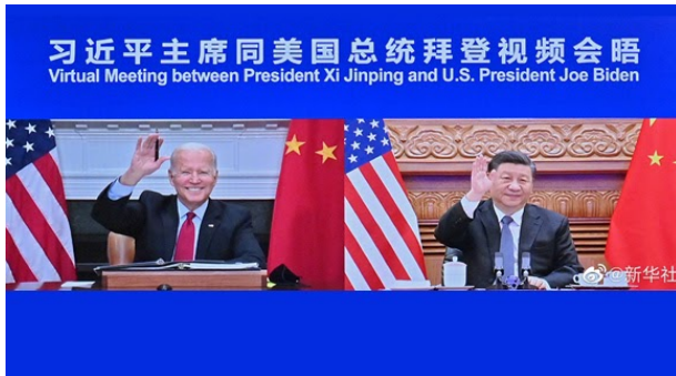
President Biden meets with President Xi in a video conference on November 15