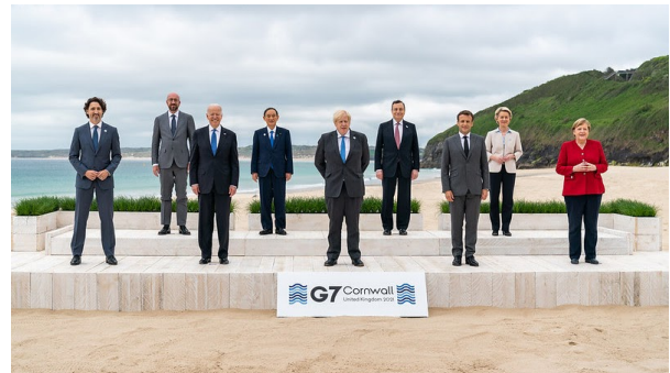
The leaders of the G7 nations pose for a picture at the G7 summit on June 11 after the bloc agreed to fund the B3W Initiative