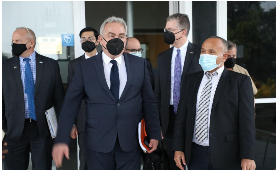
NSC Indo-Pacific Coordinator Kurt Campbell arrives in the Solomon Islands on April 22