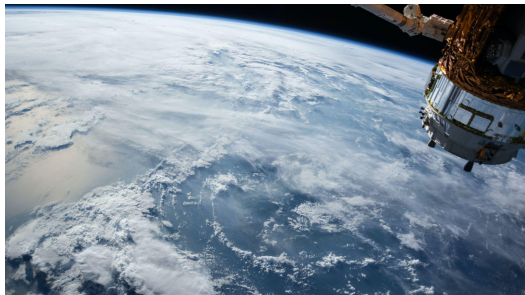
The U.S. hopes to stop its allies and rivals alike from developing anti-satellite weapons through its unilateral ban on April 19

- On April 19, the White House stated that it is banning its own anti-satellite weapons testing and hopes to establish a new norm in space security to avert an arms race. In the announcement, Vice President Harris highlighted an anti-satellite test conducted by Russia last November that launched over 1,500 pieces of space debris towards the International Space Station, calling it "reckless" and "irresponsible." China conducted a similar test in 2007. - On April 16, three Chinese astronauts returned to earth after a 180-day mission aboard the country's independent Tiangong orbital station. China's space agency is planning three more launches next month including another crew headed towards the partly-built station. - On April 13, a report by the Pentagon's Intelligence Agency stated that both China and Russia are developing weapons that could attack U.S. satellites.