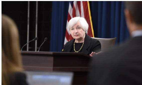
Treasury Secretary Janet Yellen said there can be no "sitting on the fence" in the Russia-Ukraine war at an April 13th event