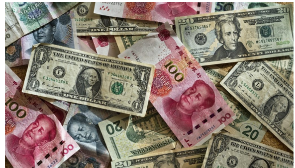
Yields on U.S. treasury bonds surpassed those of yuan-denominated bonds for the first time in decades earlier this month