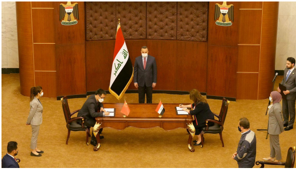
The Prime Minister sponsors the signing of an agreement of principles with China

- Although China has refused to condemn Russia's actions in Ukraine and has criticized the sweeping Western sanctions on Moscow, U.S. senior officials said they have not detected overt Chinese military and economic support, contributing to some relief in the tense U.S.-China relationship.