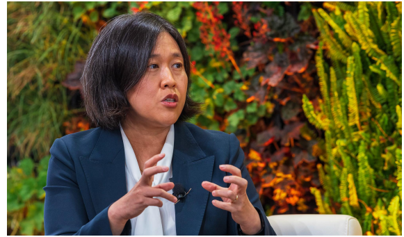
USTR Representative Katherine Tai speaking at the Milken Institute on May 2, 2022