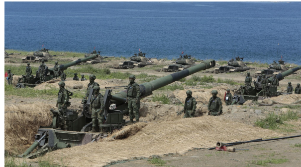
Taiwanese army training in Pingtung, May 2019.