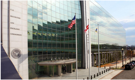
The U.S. Securities and Exchange Commission headquarters in Washington, DC.