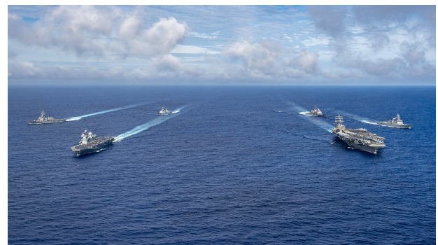
The USS Benfold sailing as part of a carrier strike group in the Philippine Sea on June 4, 2022

- On July 13, the destroyer USS Benfold performed a freedom of navigation operation (FONOP) near the Chinese-controlled Paracel Islands in the South China Sea, intended to challenge Beijing’s claim that the waters within the archipelago are China’s “territorial sea.” - On July 12, the sixth anniversary of an international tribunal’s ruling against China’s maritime claims in the South China Sea, Secretary of State Antony Blinken reaffirmed that the U.S. would come to the defense of the Philippines if its forces in the South China Sea came under attack. Blinken also called on China to “abide by its obligations under international law and cease its provocative behavior” in the critical waterway. - On July 12, Vice President Kamala Harris announced in a virtual address to the Pacific Islands Forum that the U.S. will expand its diplomatic presence throughout the Pacific by building new embassies and increasing aid. - The US Naval Institute published a report calling on the U.S. to adopt a counter-insurgency naval strategy in Southeast Asia against China.