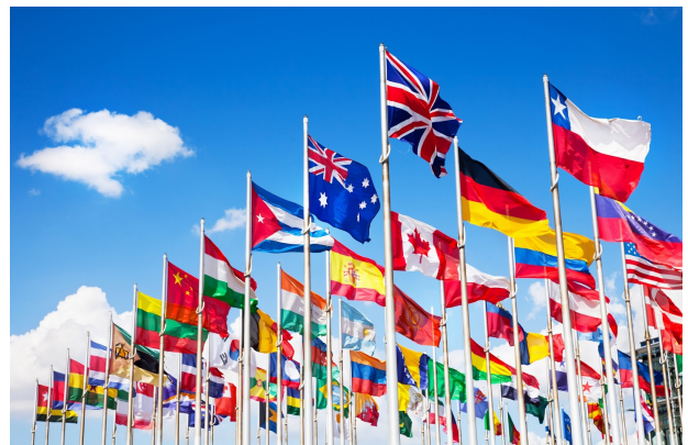
A group of national flags.