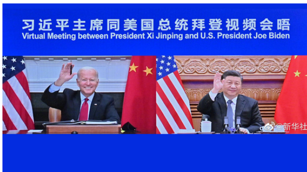
President Biden meets with President Xi in a video conference on November 15, 2021.

- On July 15, China’s Minister of Ecology and Environment Huang Runqiu held bilateral meetings in Washington with Commerce Secretary Gina Raimondo, EPA Deputy Administrator Janet McCabe, and Governor Gavin Newsom, marking the first time a Chinese official at or above the ministerial level has made a public visit to Washington during the Biden administration. - Officials in Beijing and Washington are planning a virtual meeting between President Joe Biden and President Xi Jinping “as soon as the last week of July.” - On July 8, on the sidelines of the G-20 summit in Bali, Secretary of State Antony Blinken and his Chinese counterpart Wang Yi held a five-hour meeting in which Blinken pressed Wang Yi to oppose Russia’s invasion of Ukraine, among discussions of other key issues. - After virtual talks were held between Chinese Vice Premier Liu He and U.S. Treasury Secretary Janet Yellen, China’s commerce ministry announced that the trade and economic teams of the U.S. and China have agreed to “maintain close communication.”