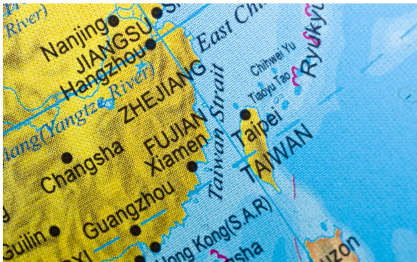
An image of Taiwan on a world map.