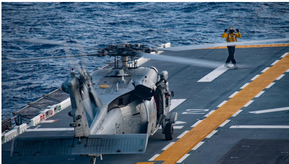
An MH-60S SeaHawk helicopter assigned to Helicopter Sea Combat Squadron (HSC) 25, Detachment, 6, lands on the flight deck of the forward-deployed amphibious assault ship USS America (LHA 6), while underway in the East China, Sea, Aug. 31, 2022.