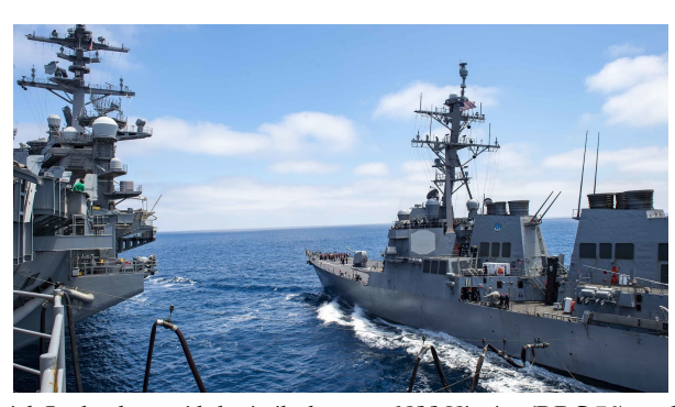
Arleigh Burke-class guided-missile destroyer USS Higgins (DDG 76) conducts a replenishment-at-sea with Nimitz-class aircraft carrier USS Carl Vinson (CVN 70).

<u>"U.S.-China Tensions Fuel Outflow of Chinese Scientists From U.S. Universities,"</u> The Wall Street Journal, September 27 [Paywall]