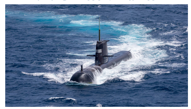
Royal Australian Navy submarine HMAS Rankin seen during the AUSINDEX 21 biennial maritime exercise on September 5, 2021 in Darwin, Australia.