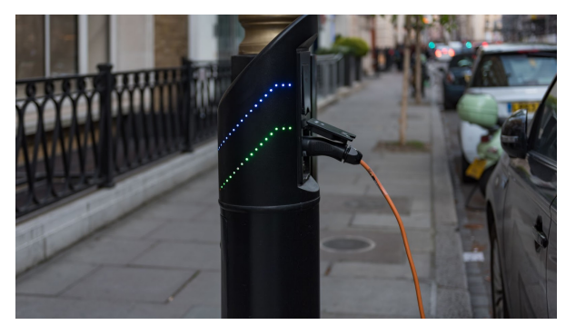
Electric vehicle charging point at kerbside, London, UK - stock photo (Source: Getty Images, Royalty-Free)