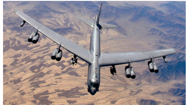
Aerial view of the B-52 Stratofortress bomber plane in February 2006.