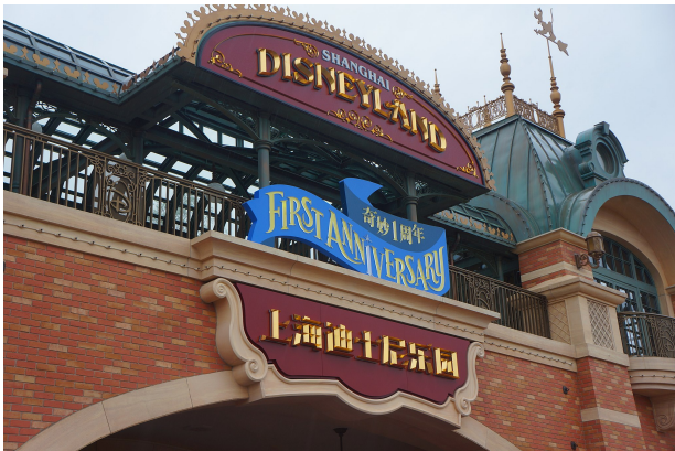
The ‘Fantastic Anniversary’ sign at the entrance of Shanghai Disneyland Park in China in June 2017.