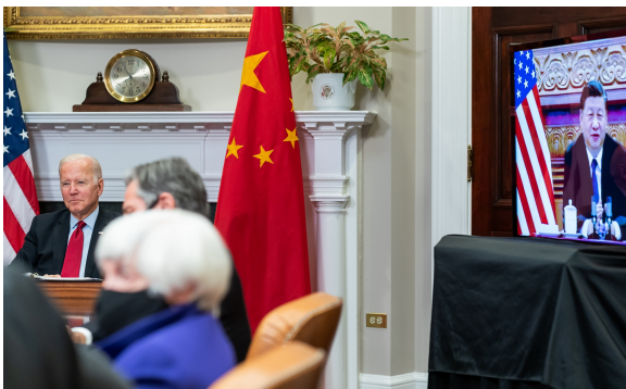
President Joe Biden participates in a virtual bilateral meeting with Chinese President Xi Jinping on November 15, 2021, in the Roosevelt Room of the White House.