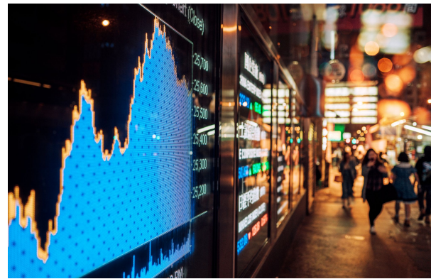
Financial stock exchange market display screen board on the street in Hong Kong.