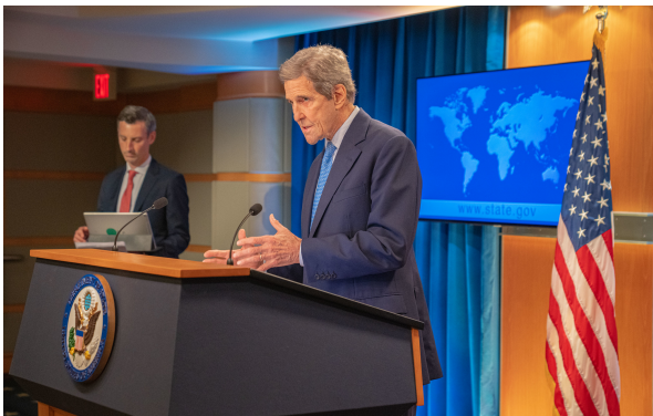
With Spokesperson Ned Price looking on, Special Presidential Envoy for Climate John Kerry addresses reporters at the Daily Press Briefing at the U.S. Department of State in Washington, D.C., on November 2, 2022.