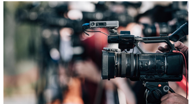
Group Of Cameras At An Outdoor Press Conference.