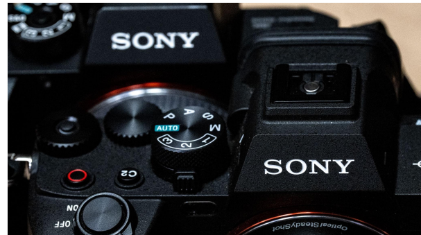
This illustration photo shows Sony mirrorless cameras in Tokyo on January 31, 2023.