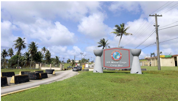
Entrance of Camp Blaz, the new Marine Corps base on the U.S. island territory of Guam, a day ahead of its opening.