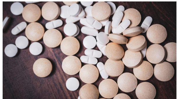
Pills representing the dangers of drug interaction and self-medication.