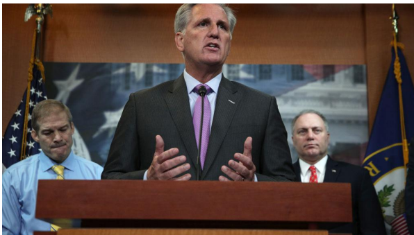
House GOP leaders held a news conference to discuss Speaker of the House Pelosi’s announcement of a formal impeachment inquiry into President Donald Trump.