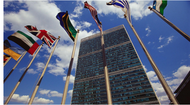
Flags fly outside the General Secretariat Building at the United Nations Headquarters.

"U.N. should follow up on China 'crimes against humanity' report, HRW says," Reuters , February 13 [Paywall] "US renews warning it'll defend Philippines after China spat," AP News , February 14 "China Says It's Ready to Enhance Ties With Taiwan Opposition," Bloomberg , February 9 [Paywall] "Tesla, after recent cuts, raises starting price of Model Y in China," Reuters , February 9 [Paywall] "Farmland Becomes Flashpoint in U.S.-China Relations," The Wall Street Journal , February 6 [Paywall] "Hong Kong: Landmark national security trial begins," DW News , February 6 "US State Department honours Chinese activist Ding Jiaxi as a 'global human rights defender'," South China Morning Post , February 1 [Paywall]