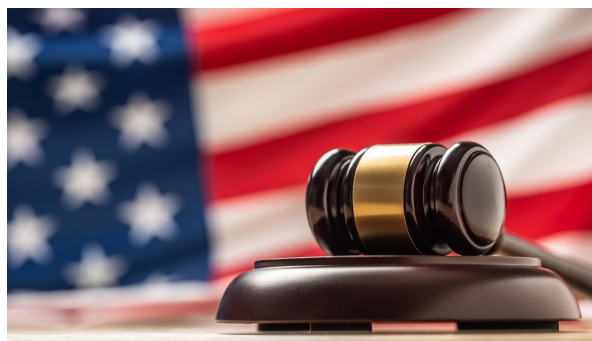
Judges wooden hammer in front of the American flag.