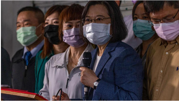
Taiwan President Tsai Ing-wen gives a speech at a press conference after casting her ballots in local elections amid tensions with China.