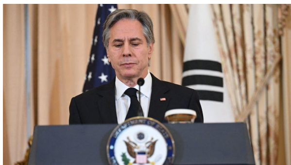
US Secretary of State Antony Blinken speaks following a Memorandum of Understanding signing ceremony.