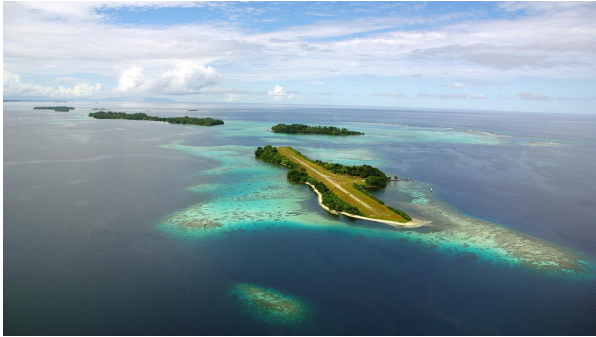
Close-Up Of Sea Against Sky.