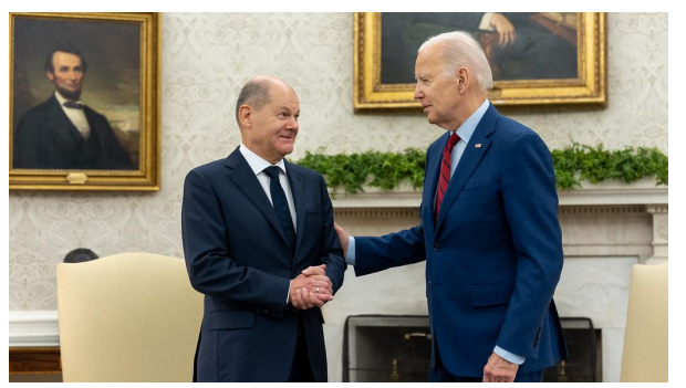
President Joe Biden greets German Chancellor Olaf Scholz on Friday, March 3, 2023, in the Oval Office of the White House.

- Iran and Saudi Arabia have agreed to re-establish diplomatic relations and reopen state embassies following talks in Beijing, indicating a large shift from U.S. influence in the region.