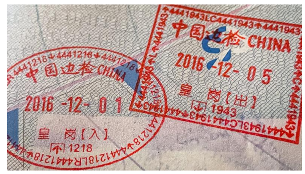
Chinese Passport Stamps

"China is fully reopening to tourists after three years of border restrictions," CNN News, March 14 "Asian Startups' Confidence in U.S. Banking Wanes After SVB Panic," The Wall Street Journal, March 13 [Paywall] "China slams Manila again over closer US military ties, warns against 'drawing wolves into the house,'" South China Morning Post, March 12 [Paywall] "To Counter China, U.S. and Allies Seek to Make Militaries 'Interchangeable,'" The Wall Street Journal, March 12 [Paywall] "G-7 should form united front versus China: ex-U.S. trade official," Nikkei Asia, March 10 "Naniing university suspends lecturer after comments about imported food, US guns," Radio Free Asia, March 10 "U.S. House unanimously backs COVID origins information declassification," Reuters, March 10 [Paywall]