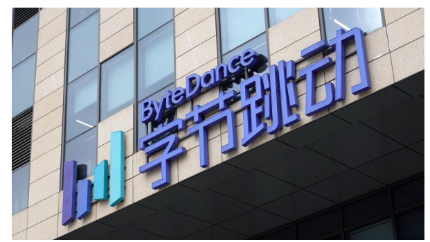
The ByteDance logo is seen at the company's headquarters on January 6, 2022 in Shanghai, China.

U.S. Senator Marco Rubio introduced new legislation that seeks to cancel Ford Motor's deal to utilize technologies from Chinese battery company CATL. 12 U.S. Senators sponsored new bipartisan legislation, created by the U.S. Senate Intelligence Committee, that would allow for the expansion of President Biden's ability to prohibit TikTok on a nationwide level; a legislation the President previously endorsed.