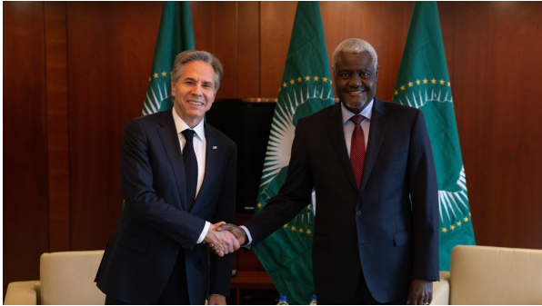
Secretary of State Antony J. Blinken meets with African Union Chairperson Moussa Faki Mahamat in Addis Ababa, Ethiopia, on March 16, 2023.