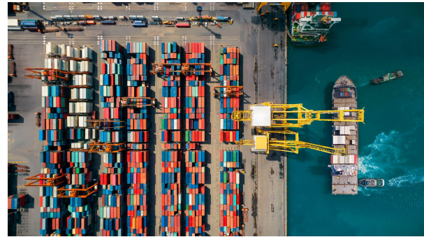
An aerial view of a sea transportation hub with import and export products.