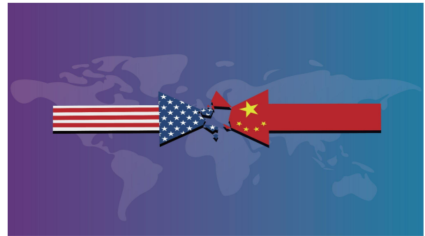
Two arrows crashing together, with one having an American flag and the other a Chinese flag over a world map.