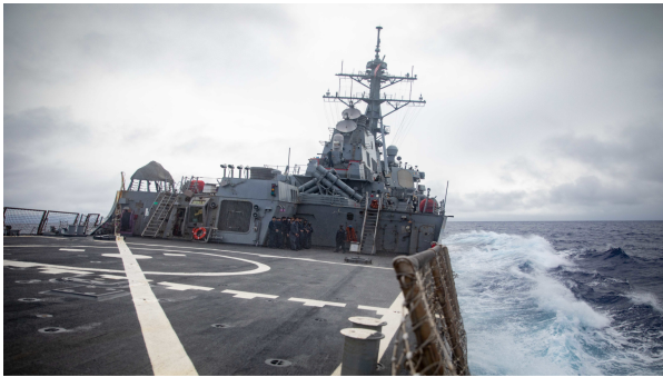
The USS Milius (DDG 69) transiting the Pacific Ocean on March 2, 2022.