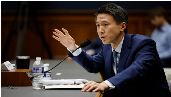
TikTok CEO Shou Zi Chew testifies before the House Energy and Commerce Committee in the Rayburn House Office Building on Capitol Hill on March 23, 2023 in Washington, DC.