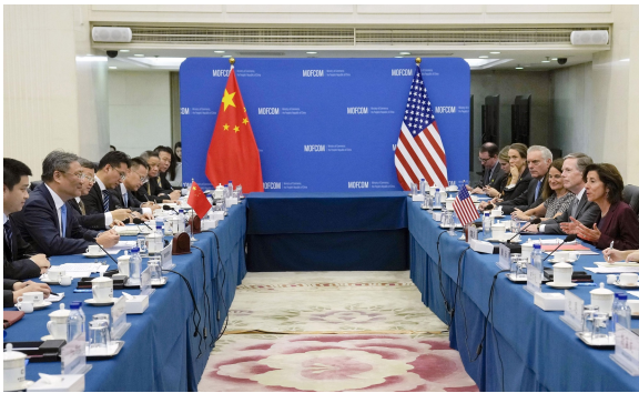
U.S. Secretary of Commerce Gina Raimondo (far R) and Chinese Commerce Minister Wang Wentao (2nd from L) hold talks in Beijing on August 28, 2023.