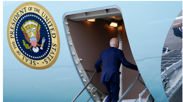
President Joseph R. Biden, Jr. boarding his plane to travel to Hanoi, Vietnam on September 10, 2023.