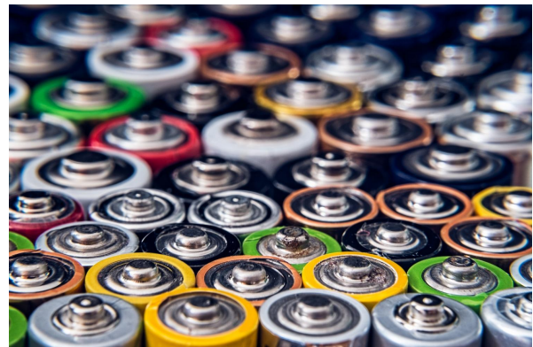
Used disposable drain batteries of various sizes.

"China Sows Disinformation About Hawaii Fires Using New Techniques," The New York Times, September 11 [Paywall]