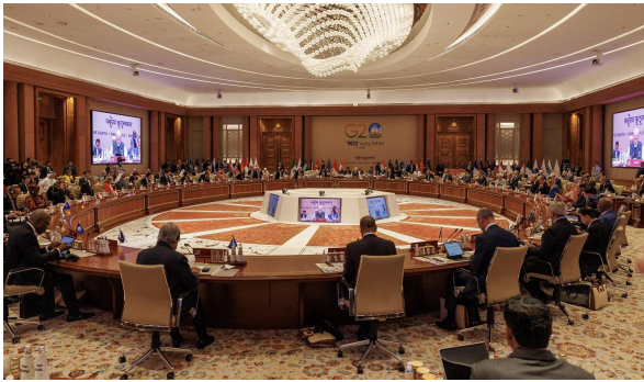
Prime Minister Narendra Modi of India welcomes leaders during the opening session of the G20 Leaders' Summit on September 9, 2023 in New Delhi, Delhi.