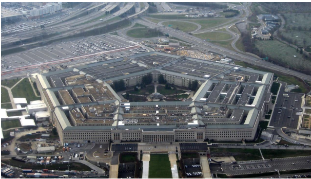
Aerial view of the Pentagon Building in Arlington, VA.