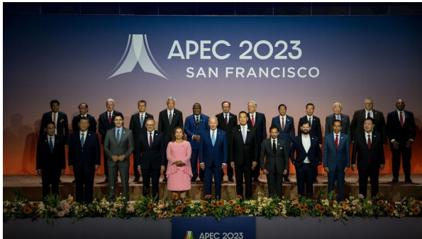
World leaders during the Asia-Pacific Economic Cooperation (APEC) Summit on November 16, 2023 in San Francisco, California