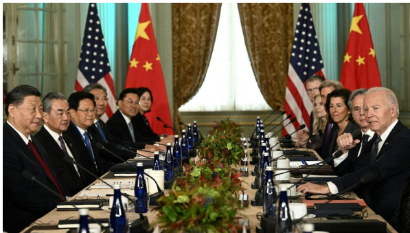
U.S. President Joe Biden meets with Chinese President Xi Jinping during the Asia-Pacific Economic Cooperation (APEC) Summit in Woodside, California on November 15, 2023.