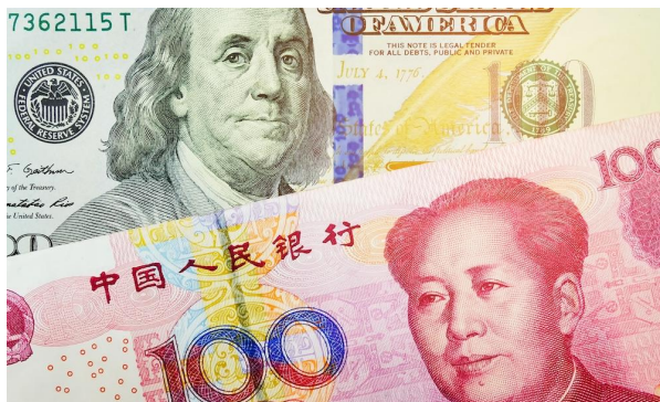
A close up view of U.S. dollar and Chinese yuan bills.

- The People’s Bank of China announced that Mastercard will be able to issue yuan-backed cards in China through domestic banks. - The Chinese government is reportedly considering a deal with Boeing to purchase some of their 737 Max jetliners, to be revealed at the APEC Summit. Boeing has not sold any of these jetliners to China since 2018. - A U.S. Industrial and Commercial Bank of China (ICBC)