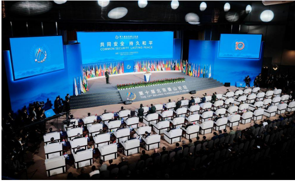
World leaders convene at the opening ceremony of the 10th Annual Beijing Xiangshan Forum on Oct. 30, 2023.