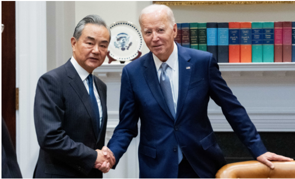
U.S. President Joe Biden and Chinese Foreign Minister Wang Yi shake hands at a meeting in the White House on October 27, 2023.