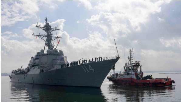
The USS Ralph Johnson at Sembawang Naval Installation on August 4, 2023.