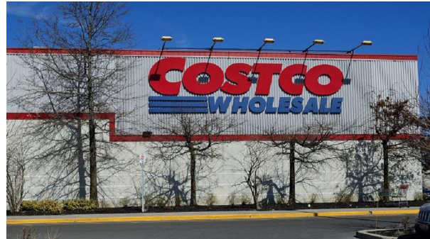
An external view of a Costco Wholesale warehouse.