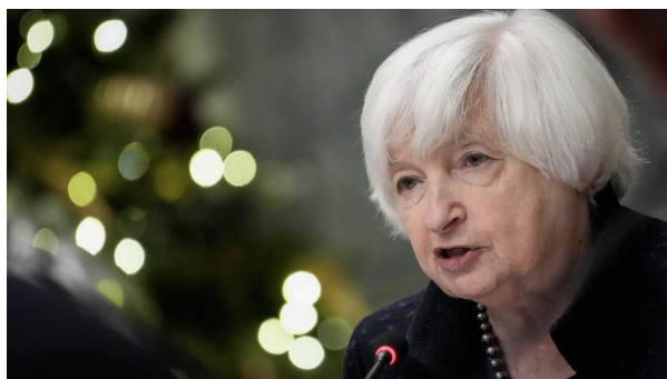
U.S. Treasury Secretary Janet Yellen speaks during a Financial Stability Oversight Council meeting on December 14, 2023, in Washington, D.C.