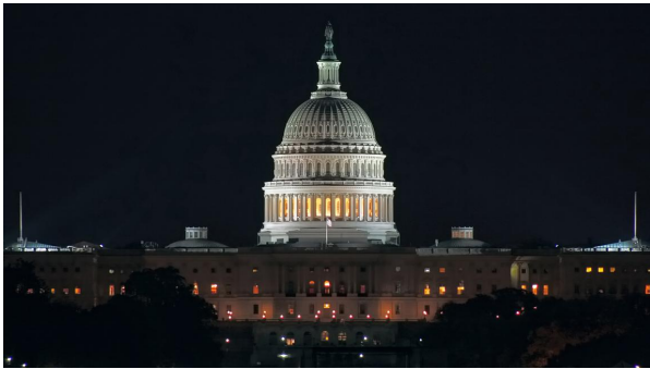
An image of the U.S. Capitol at night.