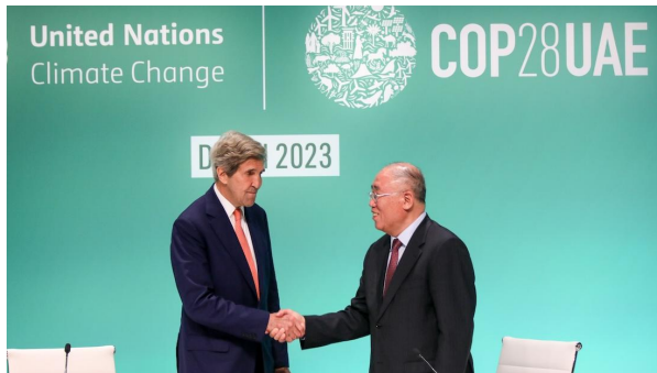
John Kerry, U.S. Special Presidential Envoy for Climate, and his Chinese counterpart Xie Zhenhua shake hands at the UNFCCC COP28 Climate Conference on December 13, 2023.