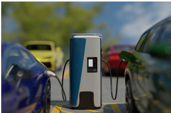
Electric vehicles charging at a station.