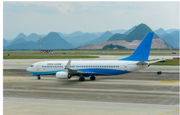
A Boeing 787 taxiing on the runway in Guiyang, China.

"After TikTok-owner ByteDance cuts the fat to focus on fundamentals, social commerce challenges and US election loom," South China Morning Post , December 27, 2023 [Paywall] "Steamy Romances and Vampires: The Chinese-Backed App Appealing to American Moms," The Wall Street Journal , December 26, 2023 [Paywall] "Apple supplier Luxshare to take control of key iPhone plant in eastern China via US$300 million deal with Taiwan's Pegatron," South China Morning Post , December 29, 2023 [Paywall] "This N.Y.U. Student Owns a $6 Million Crypto Mine. His Secret Is Out," The New York Times , December 25, 2023 [Paywall] "Chinese spaceplane being followed by six mysterious objects transmitting repeating signal," UNILAD , December 22, 2023 "Boeing's first Dreamliner delivery to China since 2019 arrives," Reuters , December 22, 2023 "Beijing shrugs at U.S. call for help protecting Red Sea shipping," Politico , December 21, 2023