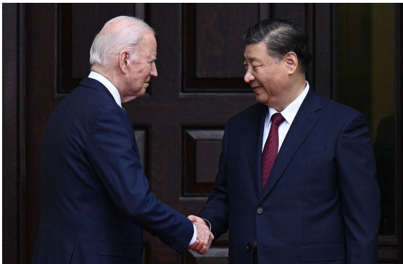
US President Joe Biden greets Chinese President Xi Jinping before a meeting during the Asia-Pacific Economic Cooperation (APEC) Leaders' week in Woodside, California on November 15, 2023.