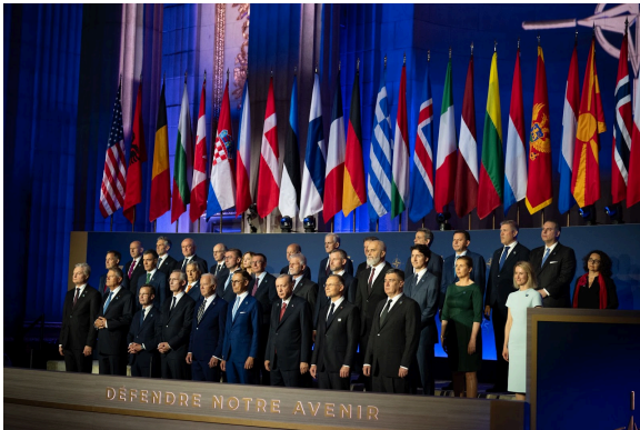
Heads of state pose for a photo during the NATO 75th anniversary celebratory event in Washington, D.C. on July 9, 2024.