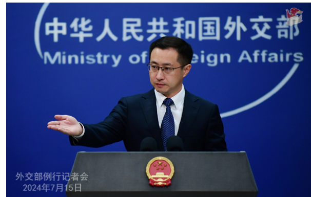
Chinese Foreign Ministry spokesperson Lin Jian answers questions in the regular press conference on July 15.