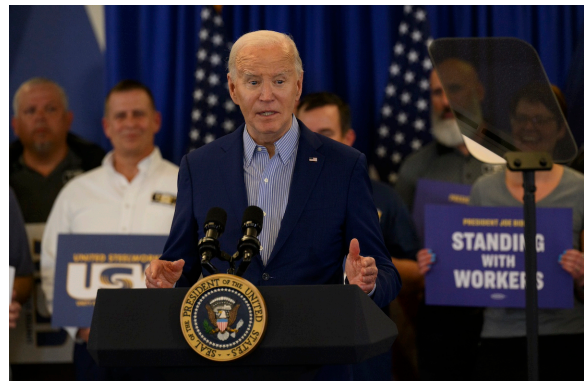
President Joe Biden speaks to the United Steel Workers Union on April 17, 2024 about potentially hiking tariffs on Chinese steel.