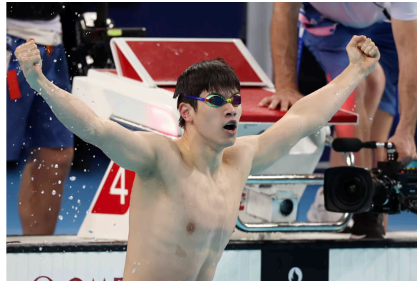
Chinese swimmer Pan Zhanle celebrates after a race at the Paris 2024 Olympics