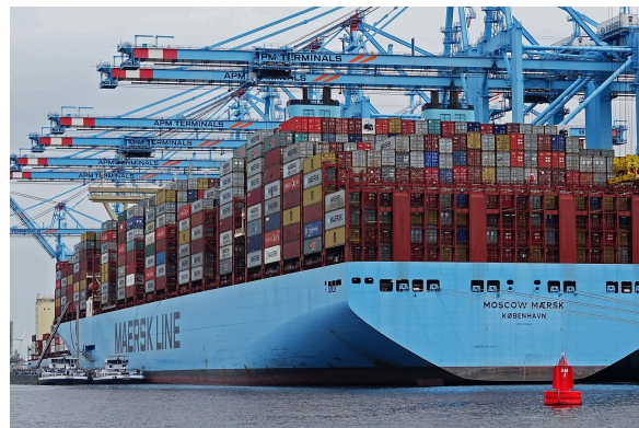
A Maersk vessel stopped at a port.