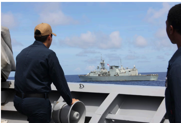
A U.S. Navy Sailor observes the Royal Canadian Navy during a quadrilateral Maritime Cooperation Activity exercise with Australia, Canada, the Philippines and the U.S. on Aug. 7, 2024.

- On August 7, the Philippines, the U.S., Canada, and Australia conducted a joint naval and air exercise in the South China Sea to underscore their "dedication to upholding international law." The exercise occurred concurrently with China's naval and air patrol in the