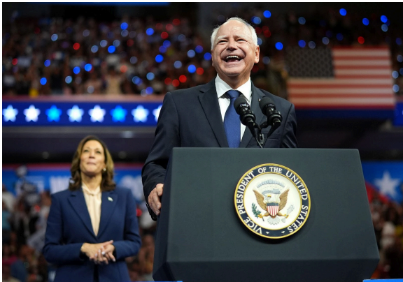
Democratic vice presidential candidate Tim Walz speaks during a campaign rally with Democratic presidential candidate Kamala Harris on August 6, 2024.