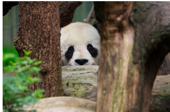
A panda bear hiding behind the trees at the San Diego Zoo in 2009.