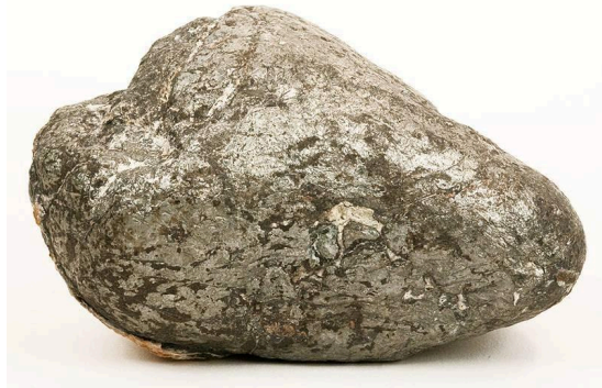
A pure nugget of solid antimony.