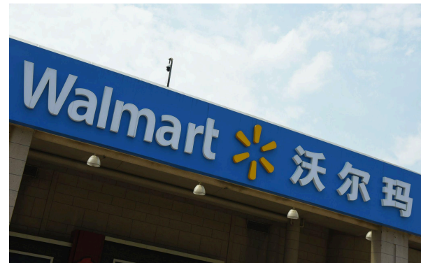
A Walmart supermarket in Hangzhou, Zhejiang Province in July 2016, around the time of the establishment of a strategic cooperation with JD.com.