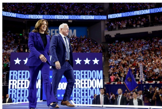
Democratic presidential candidate, U.S. Vice President Kamala Harris and democratic vice presidential candidate Minnesota Gov. Tim Walz walk onstage for a campaign rally at the Fiserv Forum on August 20, 2024 in Milwaukee, Wisconsin.