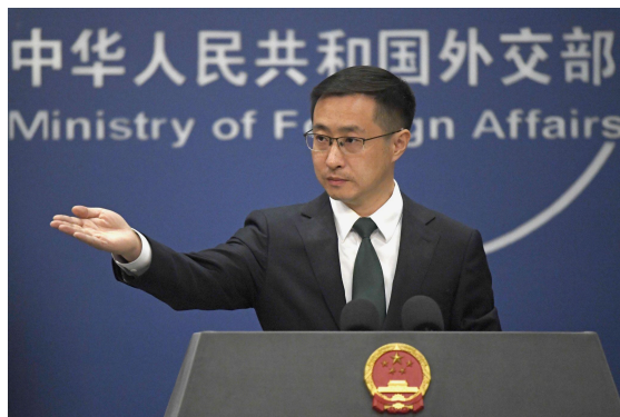
Chinese Foreign Ministry spokesperson Lin Jian attends a press conference in Beijing.