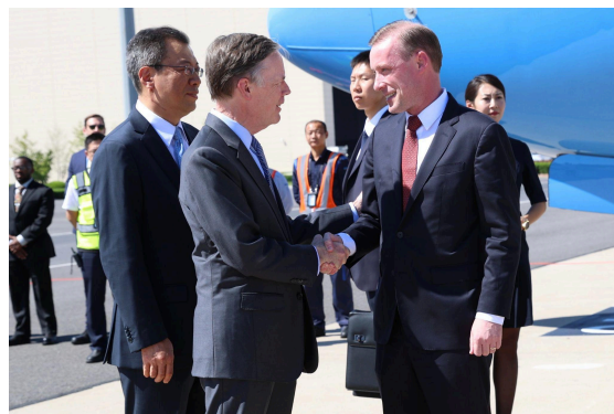
U.S. National Security Advisor Jake Sullivan greets U.S. Ambassador to China Nicholas Burns upon arriving in Beijing on August 27, 2024.