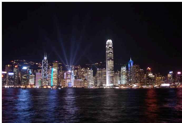
Night of Victoria Harbour, Hong Kong.