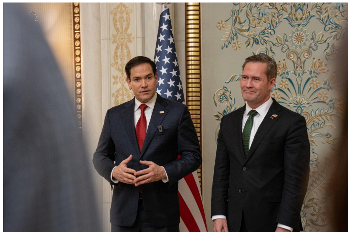
Secretary Marco Rubio and U.S. National Security Advisor Mike Waltz talk to the press March 11.