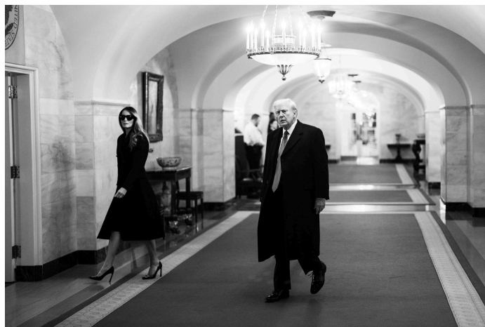
President Donald J. Trump and First Lady Melania Trump walk down the Ground Floor Corridor in the White House, Jan. 21, 2025.