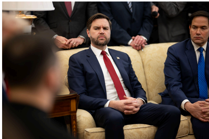
Vice President JD Vance staring at President Zelensky.