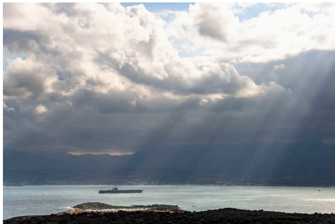
The USS Harry S. Truman arrives at the NATO Marathi Pier Complex in Souda Bay, Greece.