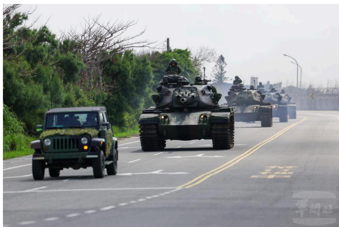
M60A3 tank tactical maneuver, preparing to execute support operations.